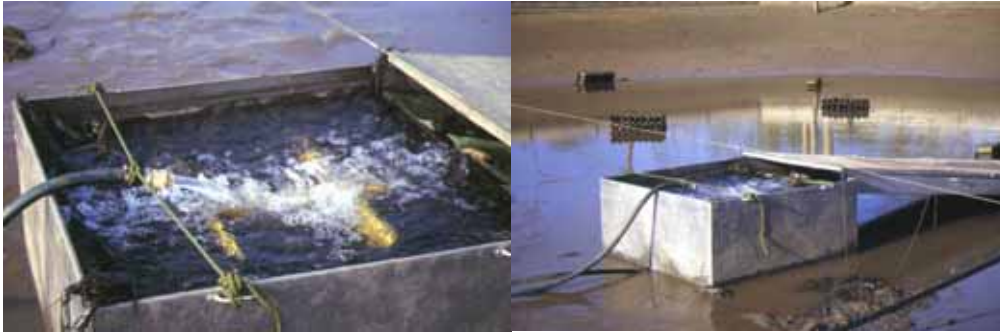
Figure 5. Redclaw flowtrap

Redclaw can be grown at different levels of intensity. Semi-intensive ponds with relatively high stocking densities (7-9 crayfish/m 2 ) will require daily management, whereas less intensive production (less than 5 crayfish/m 2 ) can be managed with lower levels of input. This form of farming may be suitable for indigenous communities where cultural events may preclude daily management. At lower densities redclaw will grow faster and larger and survival may be even better, although total yields will be less than in a higher density production.