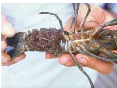
Figure 4. Eggs six weeks post spawning – ready for release

One disadvantage is the relatively low fecundity of freshwater crayfish, between 300-1,000 per spawn; however, because of the ease with which broodstock can be obtained, it is a minor concern, especially as the female can be marketed after release of the juveniles.