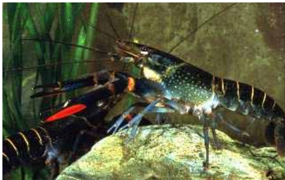
Figure 2. Redclaw ( Cherax quadricarinatus )

The harsh climatic and geographical conditions that redclaw crayfish has evolved in, have facilitated the development of broad tolerances to physical extremes. The prevailing conditions of billabongs in the Territory can be very extreme with wide variations through the day. Typically, these billabongs will have quite poor water quality with low levels of dissolved oxygen and low alkalinity, wide daily pH and temperature swings, and high nutrient loads. To make matters worse the billabong will diminish in size as the water evaporates in the dry season, leading to further crowding, higher nutrient loads and reduced food and shelter resources. These factors have combined to mould a crayfish that is tolerant to poor water quality conditions and relatively high population densities. This species is therefore relatively non-aggressive, and it is also able to utilise a wide range of food resources efficiently.