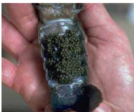
Figure 3. Eggs one day post spawning

Mating, fertilisation and spawning occur naturally in the ponds, and there are no free-swimming larval stages. The male deposits a spermatophore on the underside of the female who then spawns and fertilises eggs within 24 hours. The eggs are held under the female's tail until they are ready to hatch – usually six to eight weeks. The larvae develop within the eggs, which subsequently change colour from green, to brown to orange. Finally the eggs hatch and the 12 mm long juveniles remain attached to the female for one to two days prior to moving away as completely independent miniature forms of the adults.